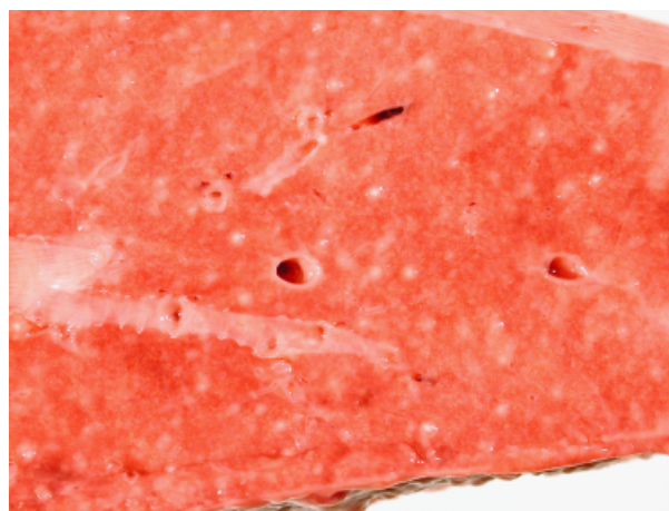
Fig 2. Macroscopic view of the pulmonary cut surface indicating multiple discrete pale granulomatous nodules ranging from approximately 3 to 5 mm in diameter.

Smears taken from the lungs were also stained for acid-fast bacteria (Ziehl-Neelsen stain), and acid-fast rods were recognized in several smears. Three attempts lasting between 12 weeks and 5 months failed to culture mycobacteria (using both solid and liquid culture media) from affected lung tissues. Spoligotyping, a PCR-based typing